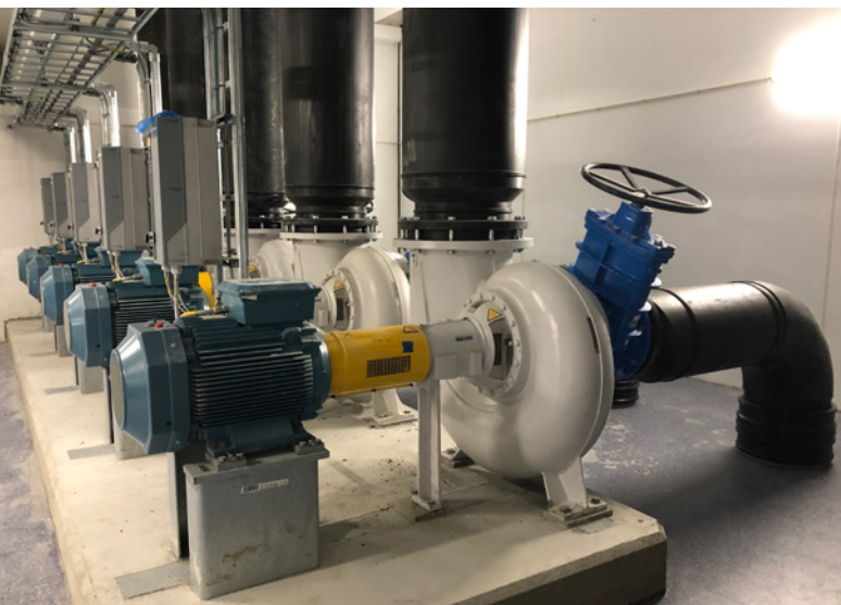
Five AHLSTAR A43-500 recirculation pumping units for brackish water