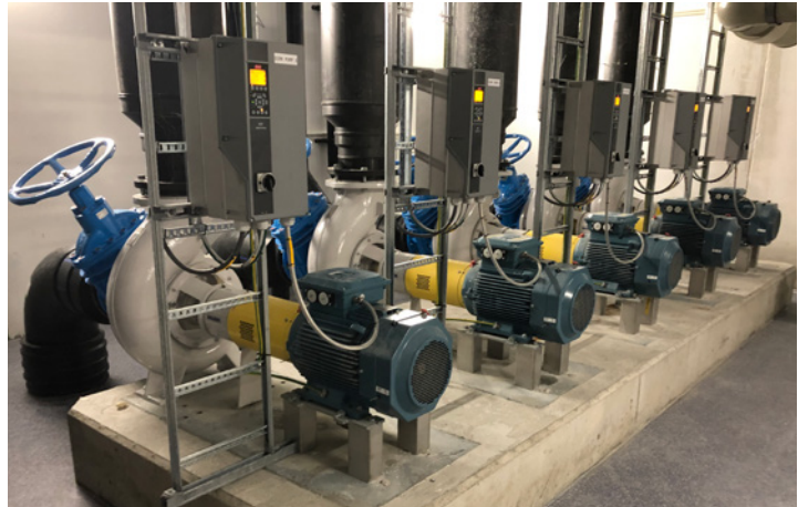
Five BE325-2532 recirculation pumping units for brackish water

Sulzer is a recognized supplier in the fish farm market, with innovative and proven pumping, mixing and aeration solutions, and provides highly energy-efficient products with low life-cycle costs and the smallest possible environmental footprint. As a material specialist in a wide range of fresh water, brackish water, seawater and brine applications, we can offer pumps in cast iron, 316 stainless steel, duplex, superduplex, SMO, etc.