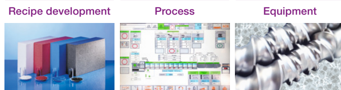
Customized EPS beads by extrusion

Sulzer – your partner for customized solutions in foam extrusion technology