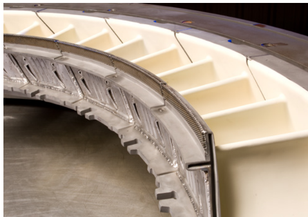
Figure 3: P23 TBC applied to full gas path of nozzle segment