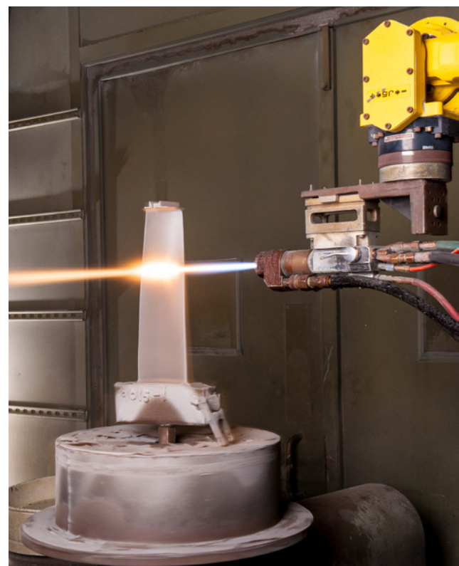
Figure 1: HVOF MCrAlY application