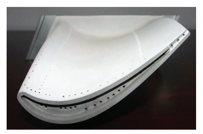
W501F R1 Blade, Fully Reconditioned and Coated with Advanced TBC