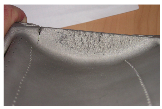
W501F R1 Turbine Blade

Solving the R1 problem with severe "pressure side" platform cracking, Sulzer Turbo Services developed a patented procedure, where the cracking is excavated and fully repaired.