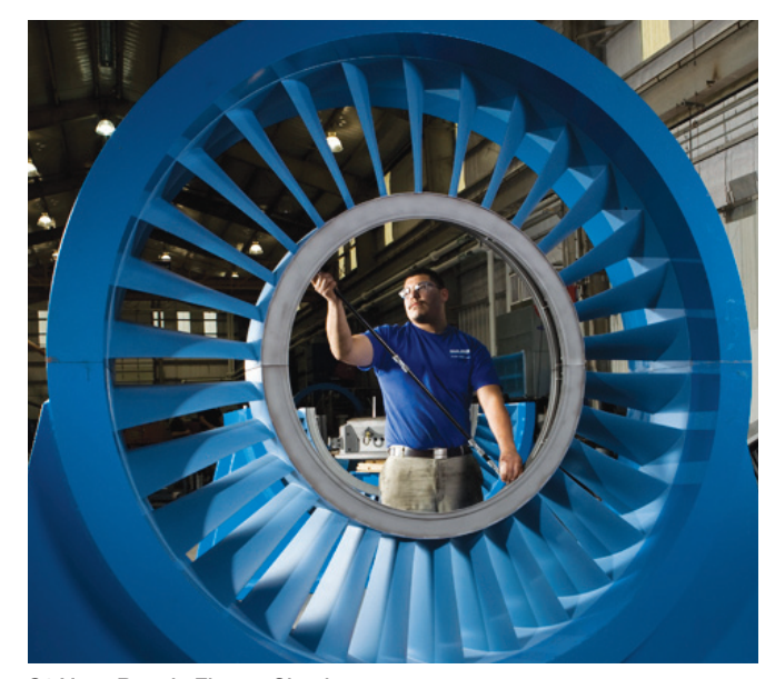
S1 Vane Repair, Fixture Check

which are then fit to 360°, heavy wall fixtures to insure correct spigot fit geometry. In all, airfoil repair, spigot fit welding, recontouring, rounding and flattening of the compressor diaphragms and coatings are all completed at Sulzer Turbo Services.