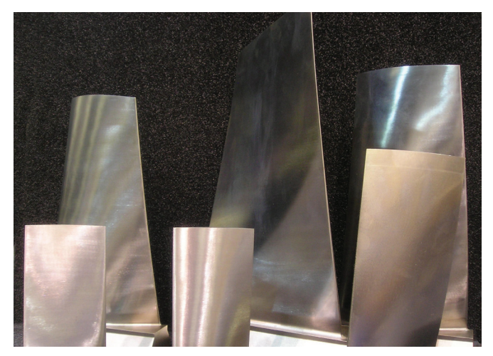
Compressor Blades Manufactured by Sulzer Turbo Services

Sulzer Turbo Services manufactures and stocks W501FD rotor compressor blades. Via precision air foil machine with advanced CNC mills, all blades are manufactured and coated at the La Porte facility. Strict QC inspections verify machining accuracy.