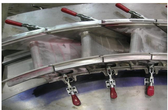
R1 Vane Fixture Check