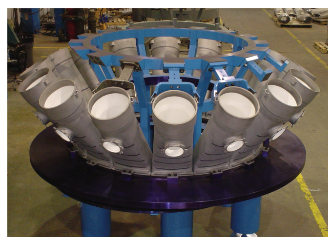
W501F Transition Repair in Full 360° Simulator Fixture

Sulzer Turbo Services repairs the original design transitions, as well as the PSM design transitions. Full 360° fixtures are utilized to check all critical fit up and picture frame dimensions. Routine repairs include picture frame replacement, panel replacement, vacuum heat treatment and where necessary, full digital X-Ray of the cooling hole passages.