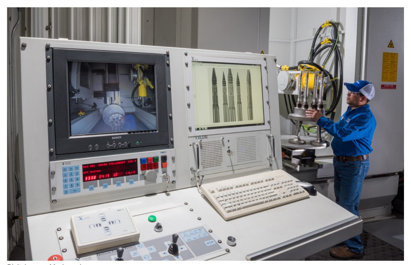
Digital x-ray of fuel nozzles