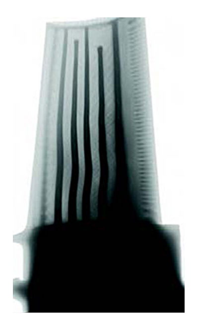
GE 7FA 1st stage bucket

Digital x-ray has opened a window into the most vulnerable areas of gas turbine components. Turbine blades, vanes, fuel nozzle components, transitions, and shafts are regularly inspected for plugged cooling holes and indications in cooling passages. Real-time, digital imagery enables Sulzer to view and document indications and irregularities well into the cooling cavities and across the length of the material wall. Precision manipulation of the components while digitally enhancing the image allows the operator to pin-point previously undetected irregularities.