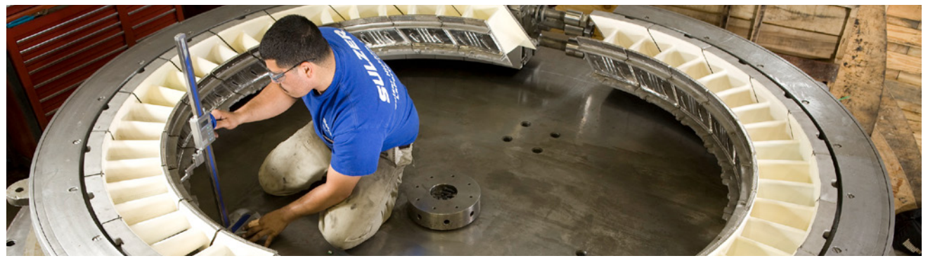
501F vane final assembly