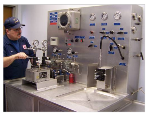
In-house designed test stand for lube systems

Since the 1980's, Sulzer Turbo Services has been providing Sulzer Turbo Services offers off-the-shelf new and ex-