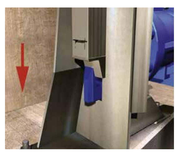
Locking (inside view)