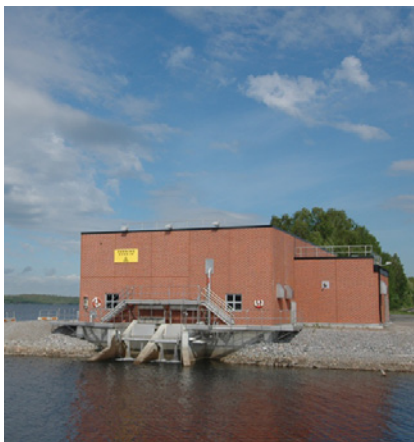
Pump station with sump inlet

SCA Packaging Munksund, a pulp mill located on the northern coast of Sweden, needed to replace its water intake station, which was built as early as 1928. A new pumping station was built in 2009. Four submersible pumps with high flow and low head were required to lift river water up to disc filters, thereafter being distributed by four AHLSTAR end suction pumps.