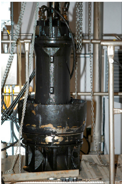
One of the AFLX pumps lifted up from the sump before being sent for regular condition monitoring