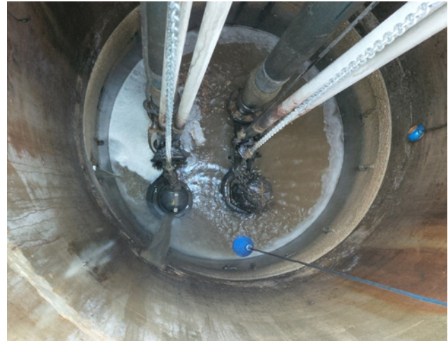
View from the top of the well. Particularly arduous as the inflow falls directly on top of the pump.

For more information on our products and services for wastewater treatment, please visit sulzer.com .