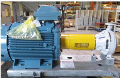
SNS pump ready for delivery to the customer's calcium mine

The customer was running slurry pumps in a simple mine dewatering application, i.e. for pumping water from the settlers onto the ground surface. It is quite common that mining and dewatering clients select heavy duty slurry pumps also for water applications, partially because good operational reliability is required. The customer, however, wanted increased capacity and higher efficiency to reduce costs in the mine.