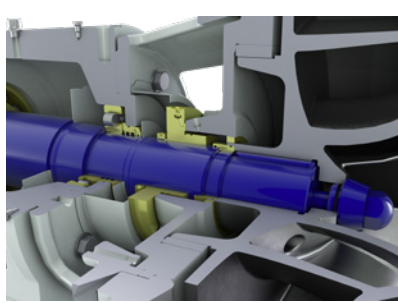
Cartridge mechanical seal