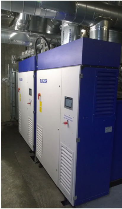
Sulzer HST 6000 turbocompressors