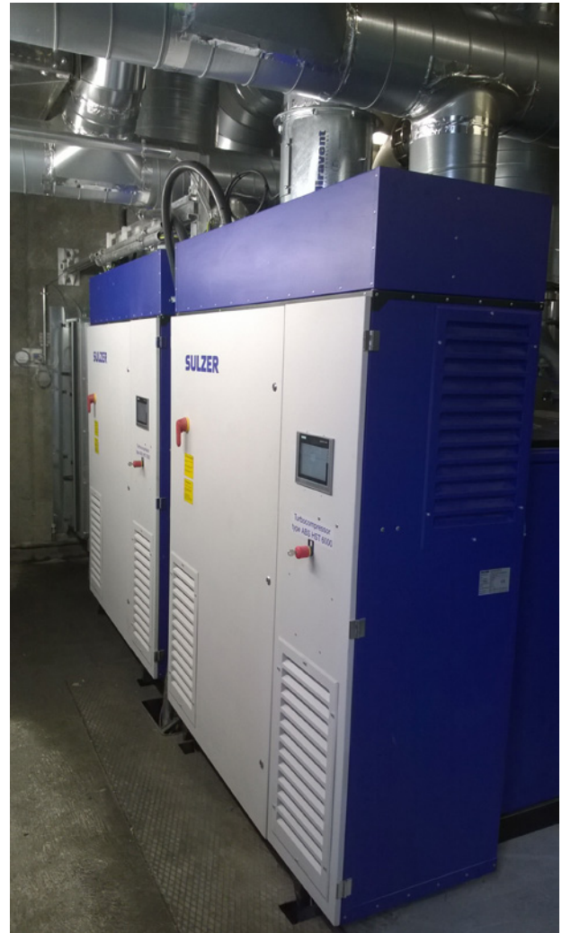
Sulzer HST 6000 turbocompressors

The HST turbocompressors are air-cooled and utilize non-contact electromagnetic bearings. This means that regular maintenance will be reduced to changing the air filters only.