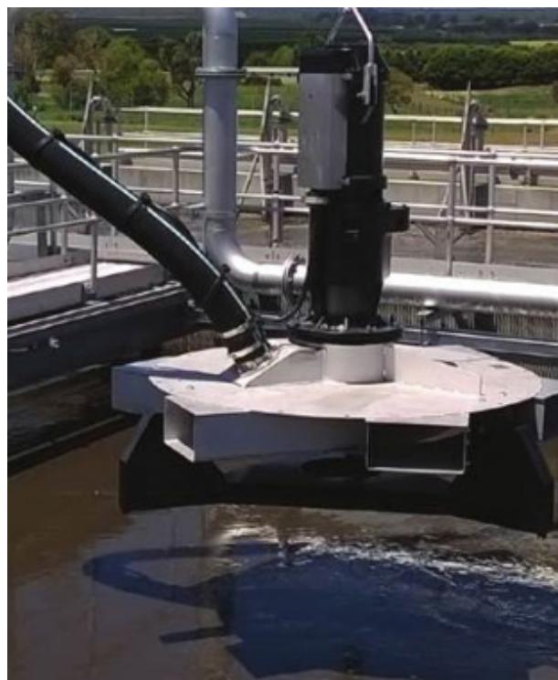
OKI aerator unit being lowered into the bioreactor