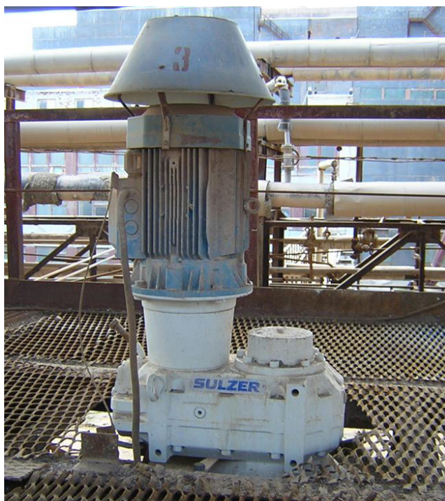
SALOMIX LV-11/71 agitator

In the manufacturing process of wet phosphoric acid (WPA), storage tanks are used in every plant. After reaction and filtration, the phosphoric acid is pumped into a storage unit. The filtrated phosphoric acid contains some chemical impurities (e.g. sulphuric acid, chlorides and fluorine) that make it aggressive. It also contains particles such as gypsum that tends to settle in the storage tanks. To avoid settling and possible plugging issues, agitation is needed in the tanks. Mixing also ensures homogeneous properties of the acid.