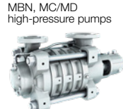
MBN, MC/MD high-pressure pumps