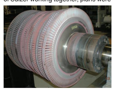
Rotor inspections being performed.

parts and the rotor, including Non-Destructive Testing, was performed in two days, which was a substantial feat considering the scope of work to be performed. All incoming inspection findings were reviewed with all parties involved. Numerous conference calls to discuss the issues at hand and a scope of repairs were agreed upon by all parties. Scheduling was of the utmost priority, with three companies of Sulzer working together, plans were