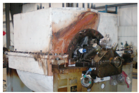
Unit set up for disassembly.

The customer called upon our location in Edmonton to expedite a complete disassembly, inspection and evaluation of the expander. The Field Service Division of Sulzer Turbo Services Houston was included in the turnaround project and they were overseeing all the