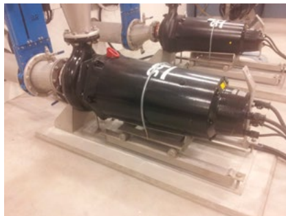
Sulzer submersible sewage pumps type ABS XFP

Sulzer recalculated the duty points of the pumps, using two years of flow data from the existing installation, and consequently selected the submersible sewage pumps type ABS XFP CB Plus with premium efficiency motors. These pumps are designed to handle today's wastewater and offer improved efficiency due to IE3 level motors.