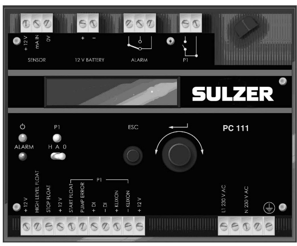
Figure 1 Pump controller PC111

CP114 will be controlled by the ABS Pump Controller PC111 (part-no. 1270 0002). Useable PC111 units with the update firmware Ver. 1.6.