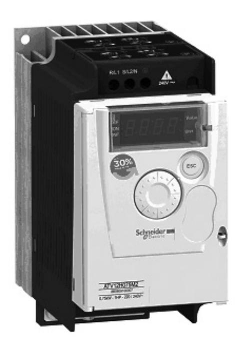
Figure 2 Frequency converter (Fa. Schneider Electric)

Before starting-up, important settings on the VFD are to be made. VFD is preconfigured, according to part-no when distributed. An examination of the parameters is urgently recommend.