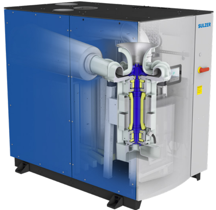
Picture 3: The HST turbocompressor has used magnetic bearings for nearly 25 years with many if the original units still in operation

Edward Paro, Portfolio Manager, Aeration, Water Business Unit, Sulzer Pumps Finland Oy