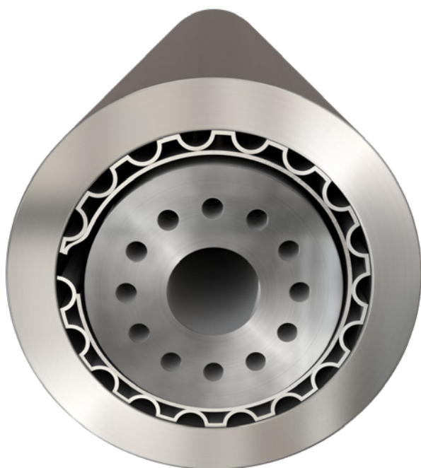
Picture 1: Air foil bearings offer a cost-effective solution but require well filtered air

This design uses electromagnets powered by an electronic control system that can adjust the forces they generate. Sensors in the housing continually monitor the position of the shaft and a control system alters the power delivered to the magnets to keep the shaft in the optimal position.