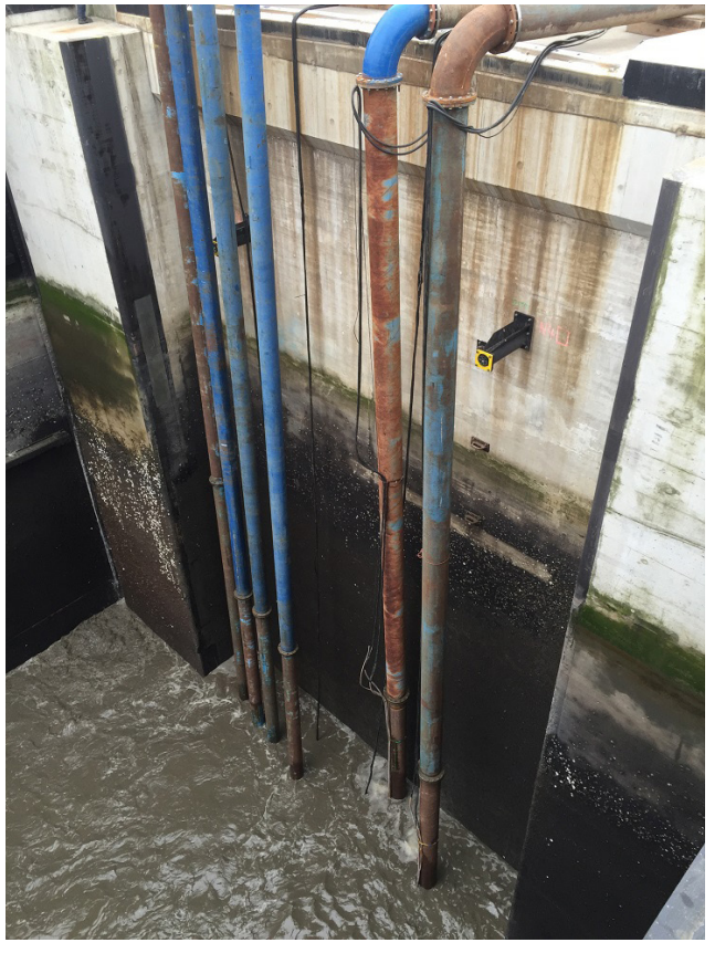
Rental pumps in the lock chamber: parallel installation of six flange pipes

Contact dietmar.hass@sulzer.com michael.sasse@sulzer.com