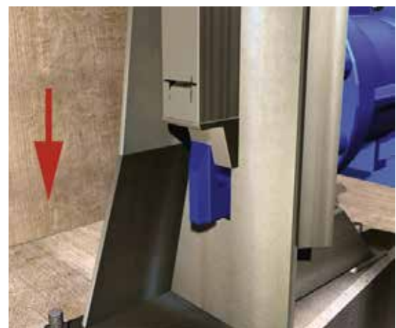
Locking (inside view)