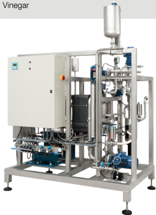
Sulzer's freeze concentration pilot plant