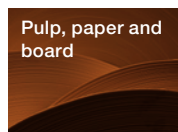
Pulp, paper and board