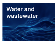
Water and wastewater