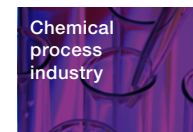
Chemical process industry