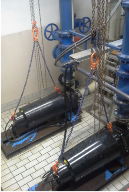
Submersible sewage pumps type ABS XFP installed in the pumping station