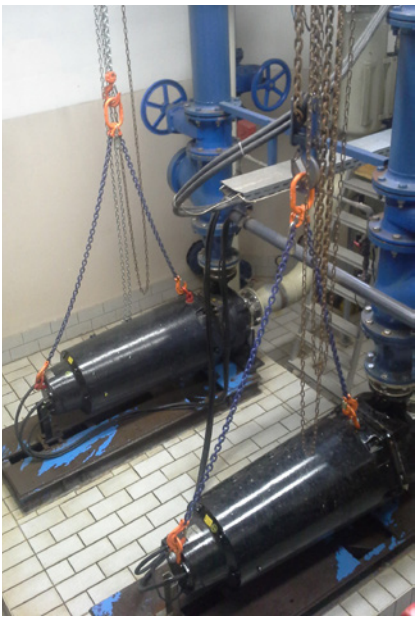
Submersible sewage pumps type ABS XFP installed in the pumping station