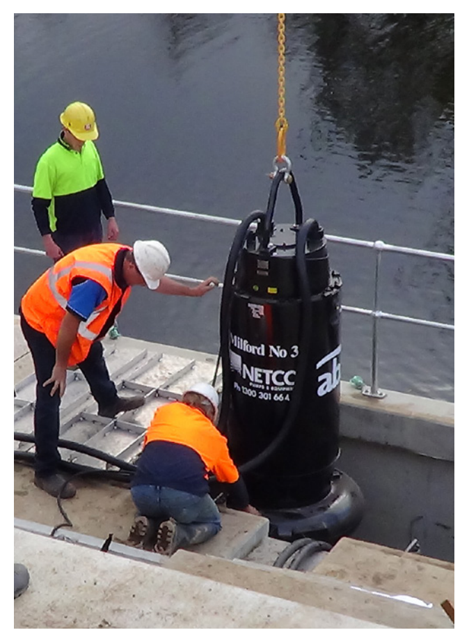
Lowering the submersible sewage pump

For more information on our products and services for irrigation, please visit <u>sulzer.com</u>.