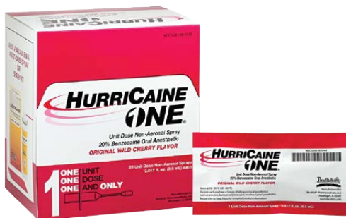
Beutlich's product for oral anesthetics

Beutlich® Pharmaceuticals LLC is a company which has been involved in the fields of relieving pain management and preventive care since 1954. To this day, the company offers the first worldwide and only orally administered anesthetic spray HurriCaine ONE. The MIXPAC™ BarrelDose Spray packaging and application system, which is part of the award-winning modular Barrel System, was developed by the Swiss company Sulzer Mixpac along with the U.S. company Beutlich Pharmaceuticals.