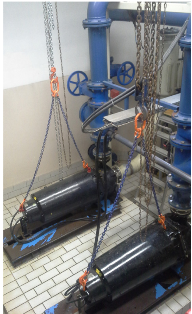
Submersible sewage pumps type ABS XFP installed in the pumping station