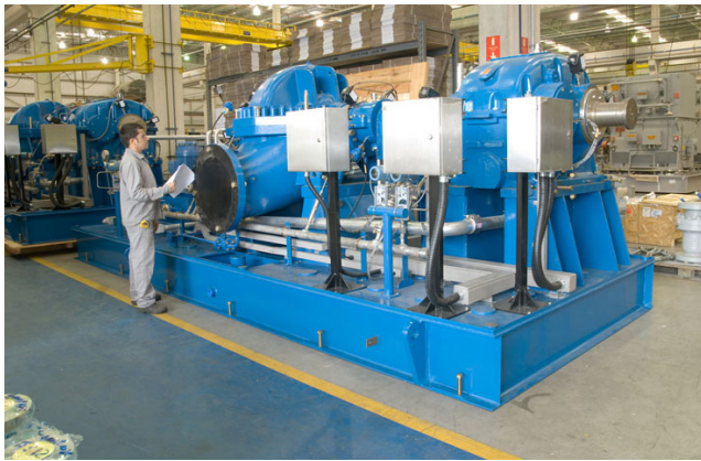
HPDM pump in final inspection before shipment.