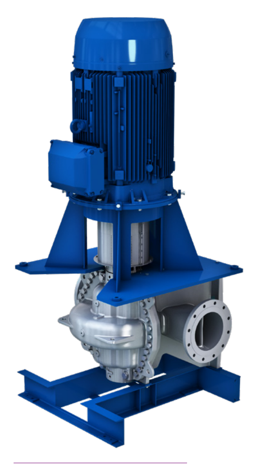
Standard SMD in vertical arrangement (SMDV)