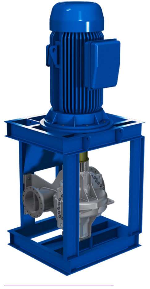
Configured SMD in vertical arrangement (SMDV)