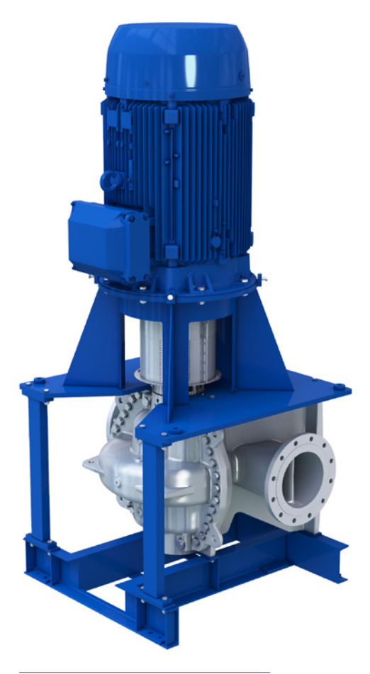
Standard SMD in vertical arrangement (SMDV)