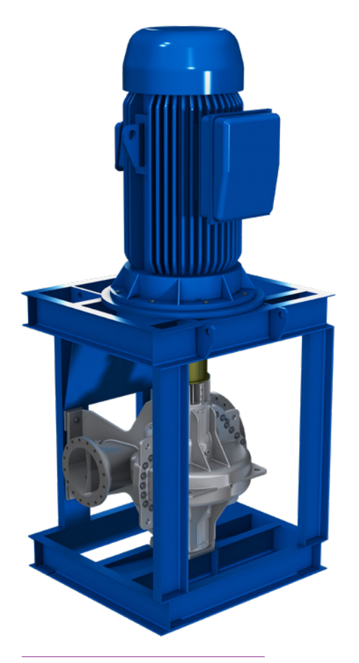
Configured SMD in vertical arrangement (SMDV)