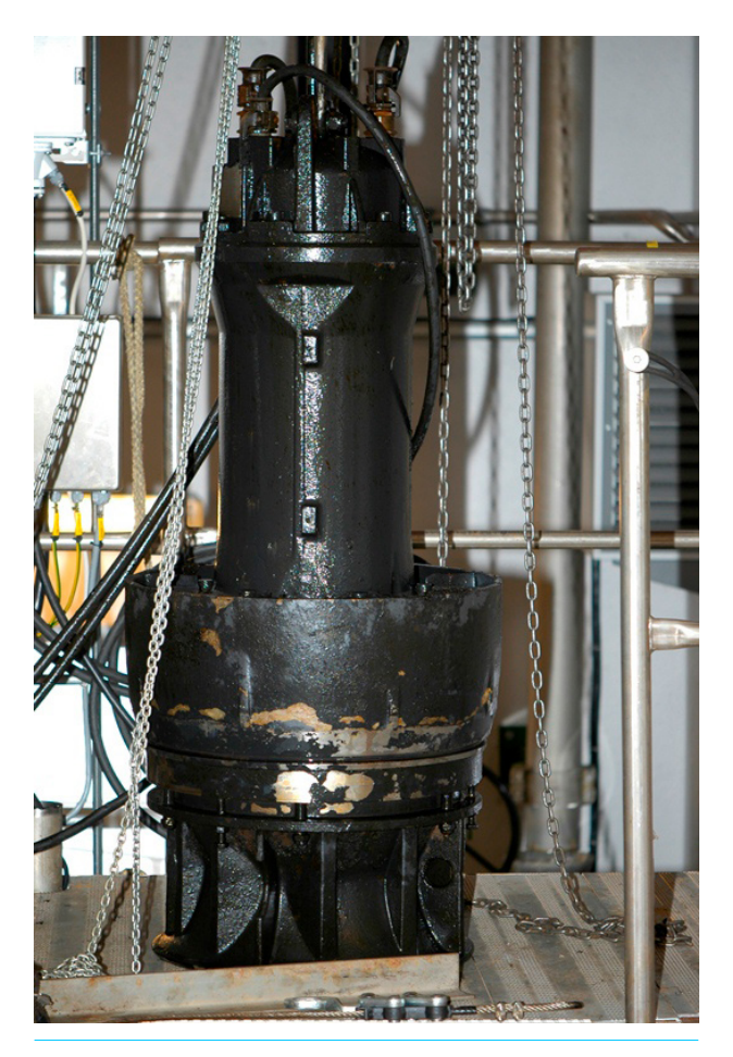
One of the AFLX pumps lifted up from the sump before being sent for regular condition monitoring