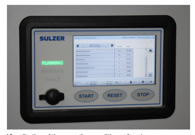
Visualization of the operating conditions of each turbocompressor

For more information about our products and services for wastewater treatment, please visit <u>sulzer.com</u>.