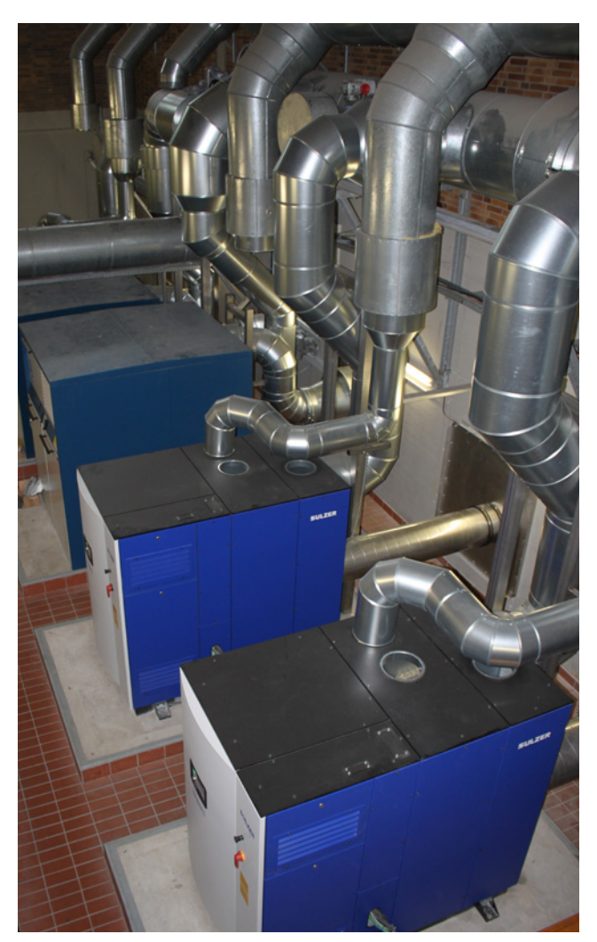
The new Sulzer HST 20 turbocompressors

From the operator's point of view, certain design features of the new compressors stand out. The magnetic bearing allows arbitrary on/off cycles without particularly stressing the machine. For the same reason the compressor operates almost maintenance-free. In operation, the visualization of the performance data directly at the compressor has proved to be advantageous, because the operating conditions can be viewed directly. Also the arrangement of the suction and discharge nozzles is favorable, since a simple pipe guidance is possible. Furthermore, the compressors are very quiet. Finally, the fast and competent support as well as the service of the manufacturer were very valuable.