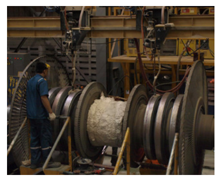
Double head welding SAW