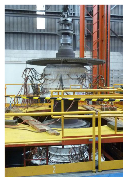
Post-Weld Heat Treatment (PWHT)