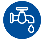
Water and wastewater