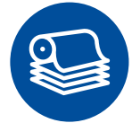
Pulp, paper and board