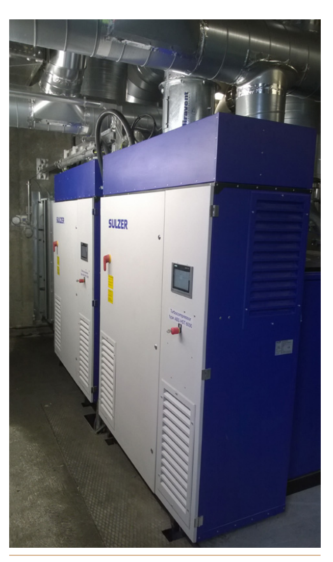
Sulzer HST 6000 turbocompressors

The HST turbocompressors are air-cooled and utilize noncontact electromagnetic bearings. This means that regular maintenance will be reduced to changing the air filters only.