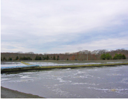
Existing stabilization pond