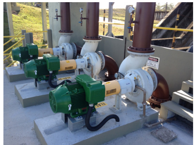
Self-priming AHLSTAR APP43-300 S pumps

As a well-known supplier for both municipal and industrial wastewater applications, Sulzer was able to define the best pumping solution for the process specification. The AHLSTAR APP-S self-priming pumps have an increased overall efficiency compared to the previous Archimedean screw pumps. The new pumping units are also much more compact than the old ones. Finally, the activated sludge is now transferred gently and the risk for splashing that would occur with the old open structure has been totally eliminated.