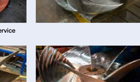
Circulating water pump impeller for power station