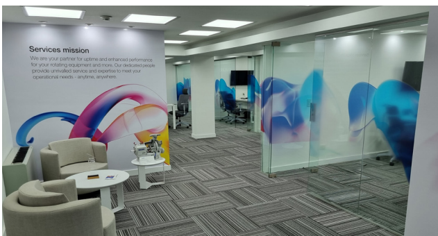
Buenos Aires main office

How can we help you? Contact us today to find your best solution.