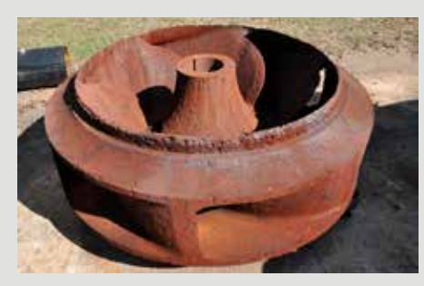
1'676 mm impeller for dewatering service