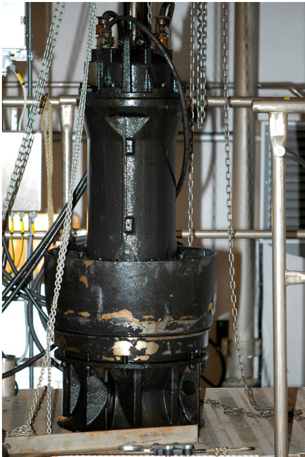
One of the AFLX pumps lifted up from the sump before being sent for regular condition monitoring