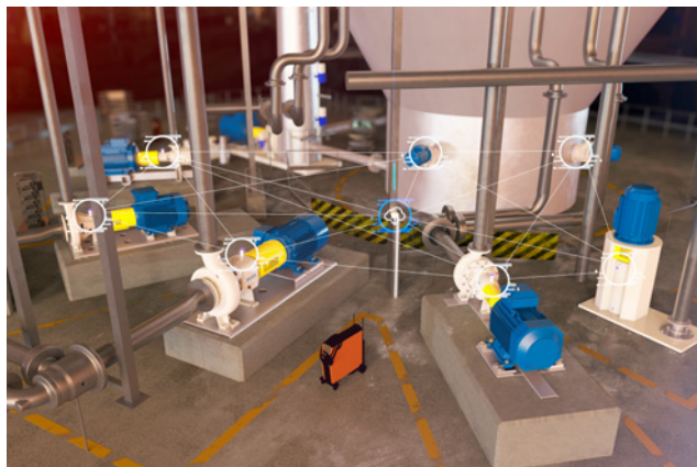
Sulzer Sense devices operate in a wireless mesh network

Replacing an over-sized pump with a more suitable design size brings a great potential for savings. In some cases, significant savings can also be achieved by modifying the existing pump with a different kind of impeller or adding a VSD.