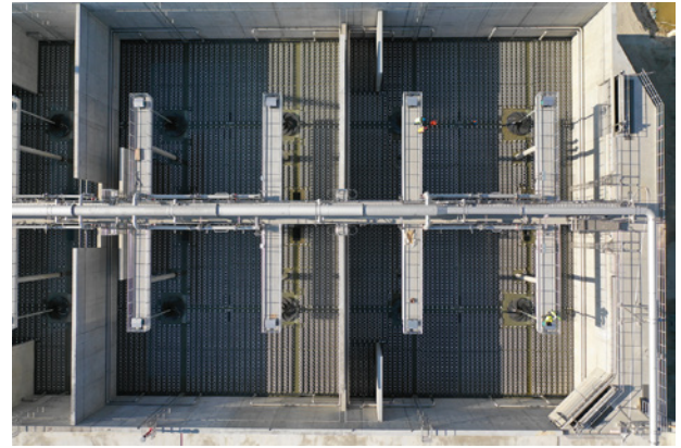
Disc diffusers are installed in the aeration tanks

To meet the project's performance specifications, the Scaba units would need to achieve 90% homogenization of a tank in a maximum of two hours. When the first unit was installed on site, tests conducted by the Vienna University of Technology, the project's academic partner, showed that the 90% point was reached after only one hour and seventeen minutes. A further benefit of the Sulzer Scaba is its free-hanging design. The agitator blade is suspended from a 25-meter shaft with no bottom bearing. This ensures that any fibrous material in the sludge can travel down the shaft with the natural movement of the material and fall off the bottom, eliminating the risk of tangling and jamming in operation.