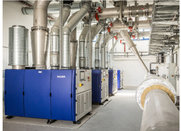
Sulzer's HST turbocompressors reduced total power consumption by 400 kW

In addition to the solution for the digester tanks, Sulzer also delivered further savings in the new aeration lanes. During the water treatment process, air oxygenates the water through an array of fine-bubble diffusers. In conversations with the project team, Sulzer's engineers learned that their planned air supply configuration used three large 1.2 MW compressors. After analyzing the pressure and flow requirements, Sulzer suggested that the required output could be delivered using eight smaller 400 kW HST turbocompressors. The alternative configuration reduced total power consumption by 400 kW, while the rugged HST compressors also offered quieter operation, high availability and very low maintenance costs. For this part of project, Sulzer delivered the compressors along with custom-designed diffusers and the associated pipework. Making major changes to an operational wastewater treatment facility is always a challenge, especially when that site serves a major city and processes up to 1'000 cubic meters of wastewater per minute. The Sulzer team worked closely with the project engineers to match delivery, commissioning and testing of the new equipment with their phased construction timeline. The aeration lanes have now been operating efficiently for three years and the E_OS project has been completed on time, bringing the sludge treatment plant to full operation.