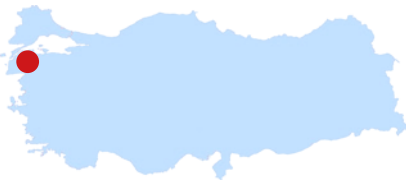
Karabiga Cenal power station located in Çanakkale province, Turkey

Cenal Elektrik is building a new 2x660 MW ultra-supercritical coal-fired power plant near Çanakkale on the coast of Turkey's Sea of Marmara. Using the ultra-supercritical thermal power plant technology will increase the efficiency of the power plant while reducing its emissions.