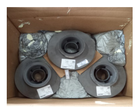
New designed impellers