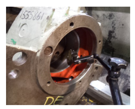
Bearing housing concentricity check