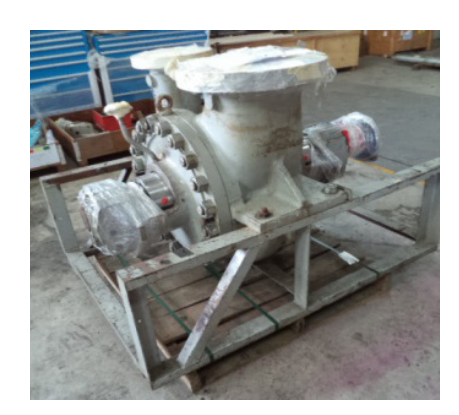
Pump as received from the customer

The platform named Kinabalu A was operated by Shell Malaysia for more than 25 years. The concession expired and the platform was handed over to PETRONAS as an asset owner which subsequently appointed Talisman Malaysia Limited as an operator. Situated at East Malaysia Sabah, production from Kinabalu averaged 7 mboe/d in 2014. In 2015, the company planned to continue progressing the Kinabalu redevelopment project. One of the sanctions that were needed to suit the new requirements was an upgrade of the crude oil transfer pump through Sulzer.