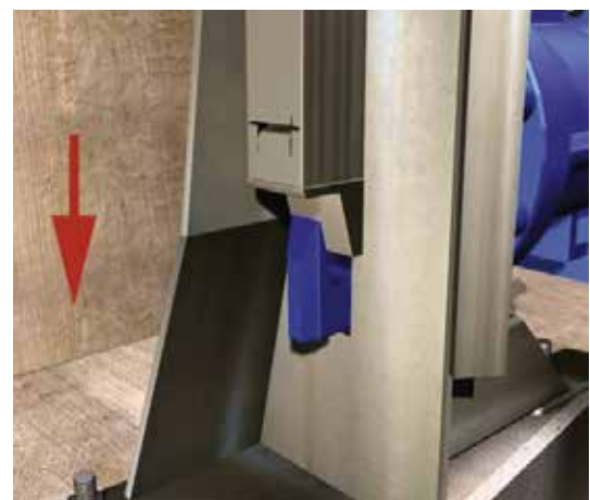
Locking (inside view)