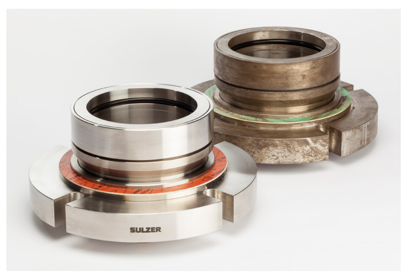
Seal after service, and seal before service