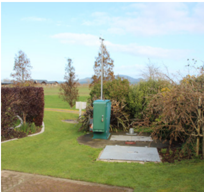
Nice view from outside the station

The Kaimai Range is a mountain range in the North Island of New Zealand. It separates the Waikato in the west from the Bay of Plenty in the east. The area has a population of around 30 000. In a retirement village, Kaimai Valley Services had a pump station that was blocked with soft solids (rags, etc.) on average 1-2 times per week. The installed pumps were 150 mm submersible units.