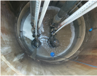
View from the top of the well. Particularly arduous as the inflow falls directly on top of the pump.

ment offers a huge time, cost and – most importantly – occupational health and safety benefit to the customer.