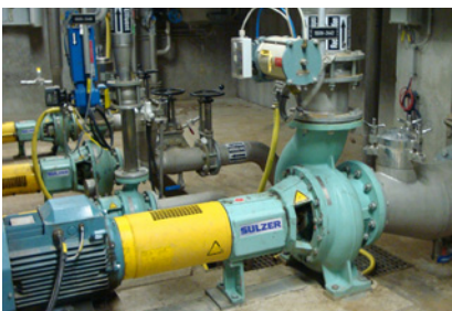
AHLSTAR APP41-200 with open impeller and dynamic seal pumping return activated sludge

Built in 1992, Norske Skog Golbey located in France is the largest newsprint production facility in Western Europe with a capacity of 600,000 tons per year. The paper mill includes a conventional wastewater treatment plant which treats about 20,000 m 3 per day of process effluents. At the output of the plant, about 30% of the discharge water is reintroduced into the mill circuit and the remaining 70% is returned to the Moselle river. Despite the increasing stringency on the quality of the discharge water, no environmental incident has occurred since the start-up of the plant.